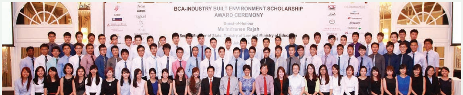
The many young bright sparks for the sector.

In recent years, there has been an encouraging upward trend in the number of female recipients for the scholarship awards. This year, almost 40% of the recipients are females. Such is a sign that the BE sector, traditionally perceived to be male-dominated, is seeing growing interest from females.