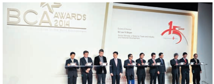
MoU signing between BCA and the CIJC during the BCA Awards 2014

Key initiatives under the roadmap were formulated to drive transformations in the sector to offer better work environment, better Human Resource (HR) practices, and meaningful careers to our local talent, including females. Beyond these, the Roadmap would also focus on raising awareness on the sector through structured internships for students and attachment programmes for teachers.